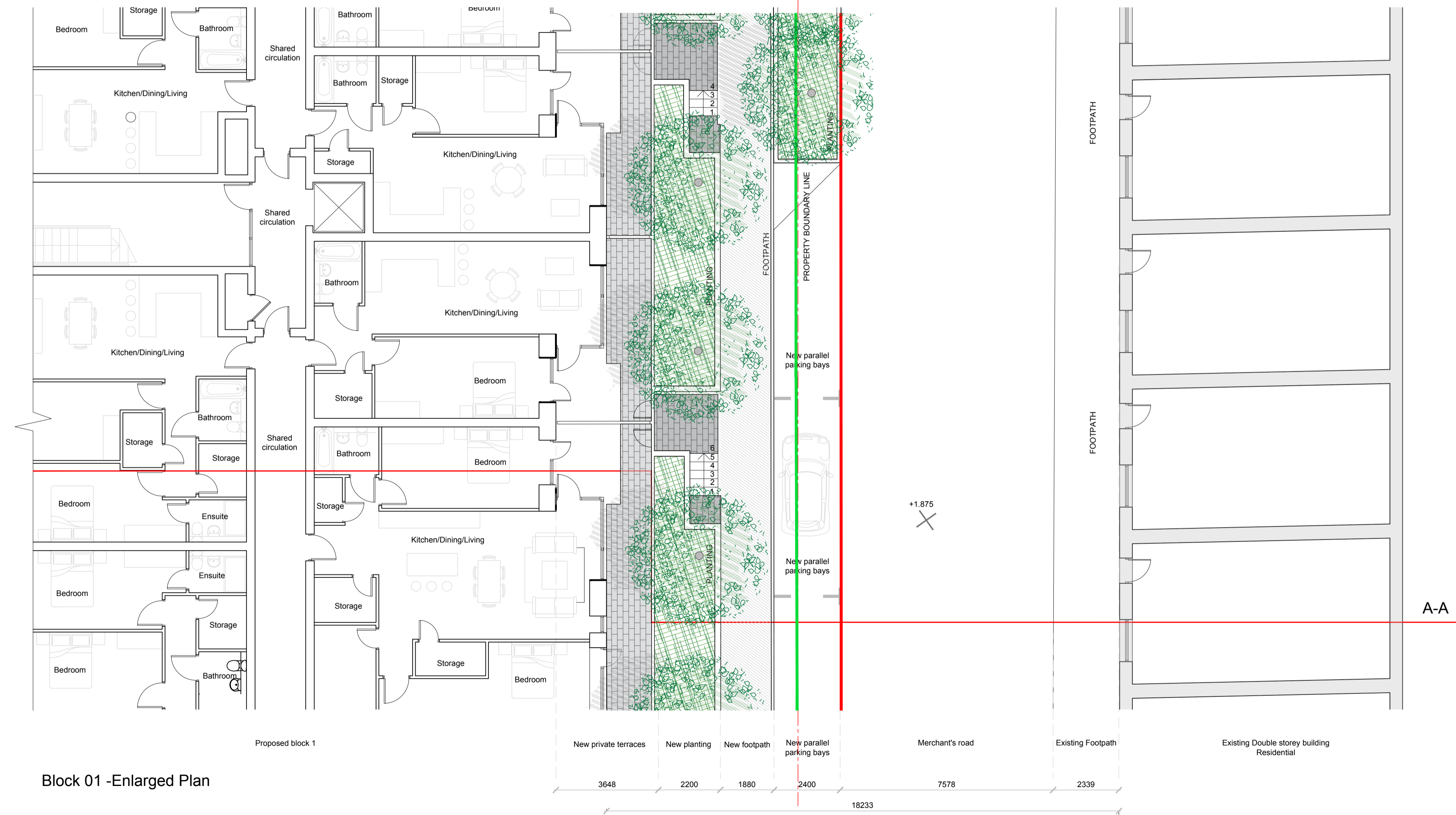
Block 01 - Enlarged Plan

LEVELS GIVEN ON HOUSE TYPE DRAWINGS ARE GIVEN TO A LOCAL ABSOLUTE ZERO LEVEL. FOR SPECIFIC LEVELS DEPENDING ON INDIVIDUAL UNIT LOCATION. REFER TO ARCHITECT'S CONTEXT SECTIONS AND ENGINEER'S DRAWINGS WHERE LEVELS ARE ALL GIVEN IN RELATION TO LAND SURVEYOR'S BENCHMARK BASED ON MALIN HEAD DATUM LEVEL.